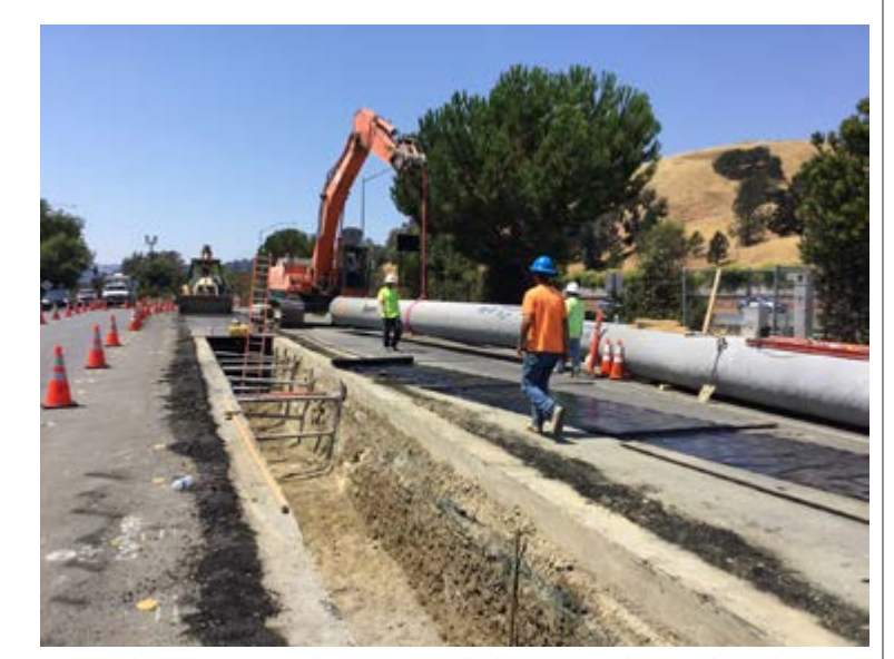
A 30-inch pipe is currently being installed on. Mt. Diablo Boulevard.

array of orange cones and the giant hole in the ground on the east end of Lafayette? It will be a lons of water per day. shiny new water pumping plant, Hardware that was built in 1956.